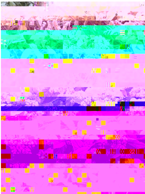
Fall on the playground